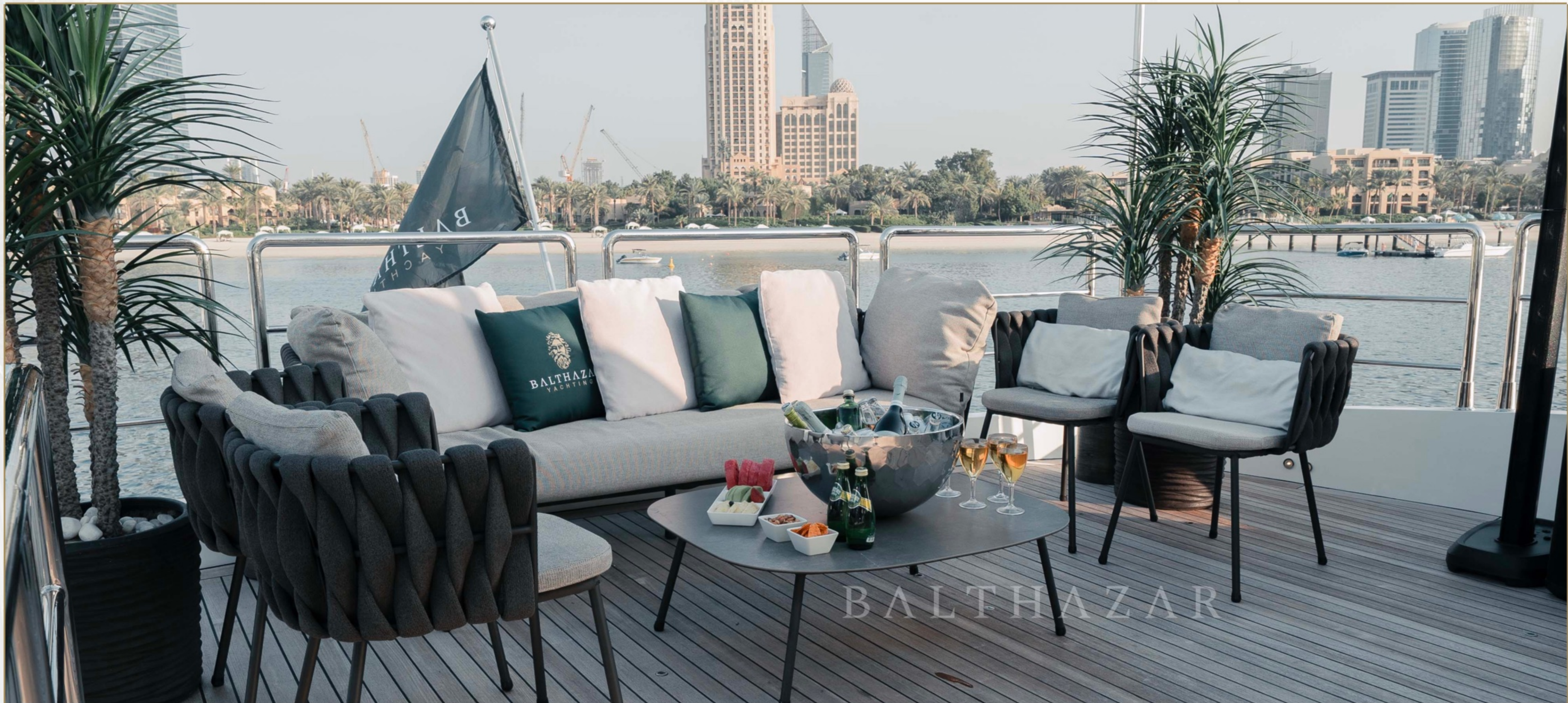
Top Deck Back Area