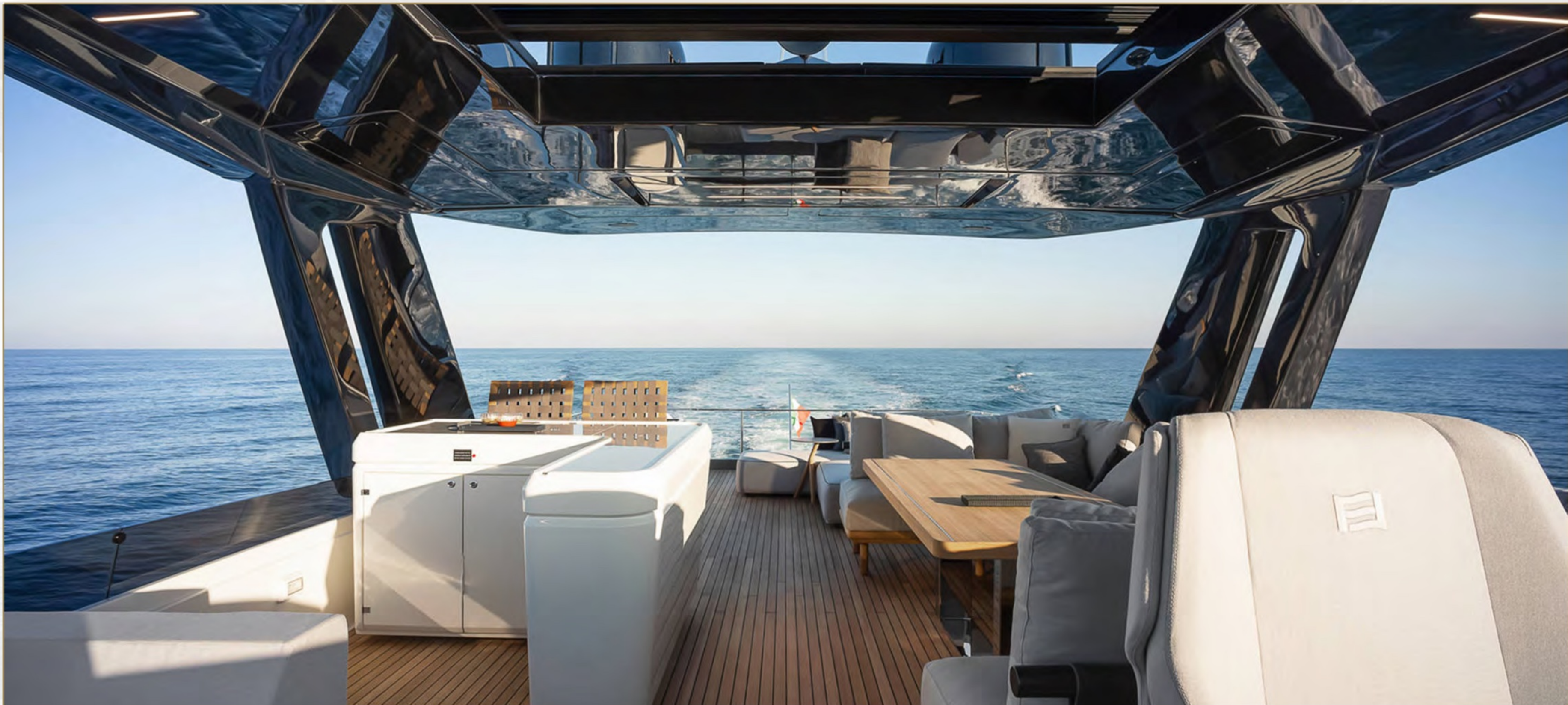
Top Back Deck