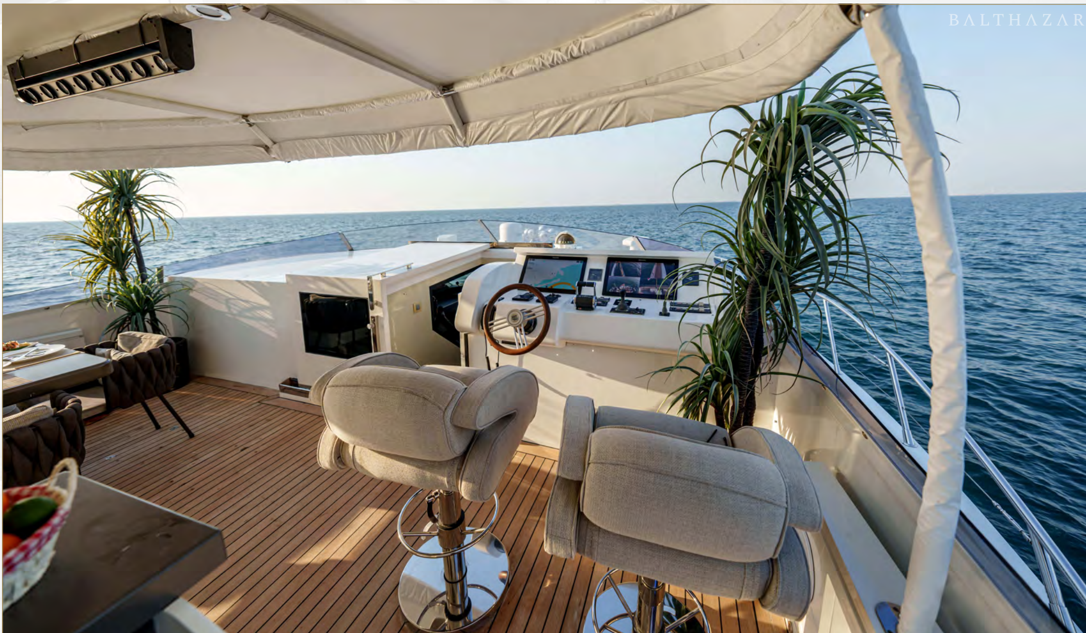
Top Deck Front