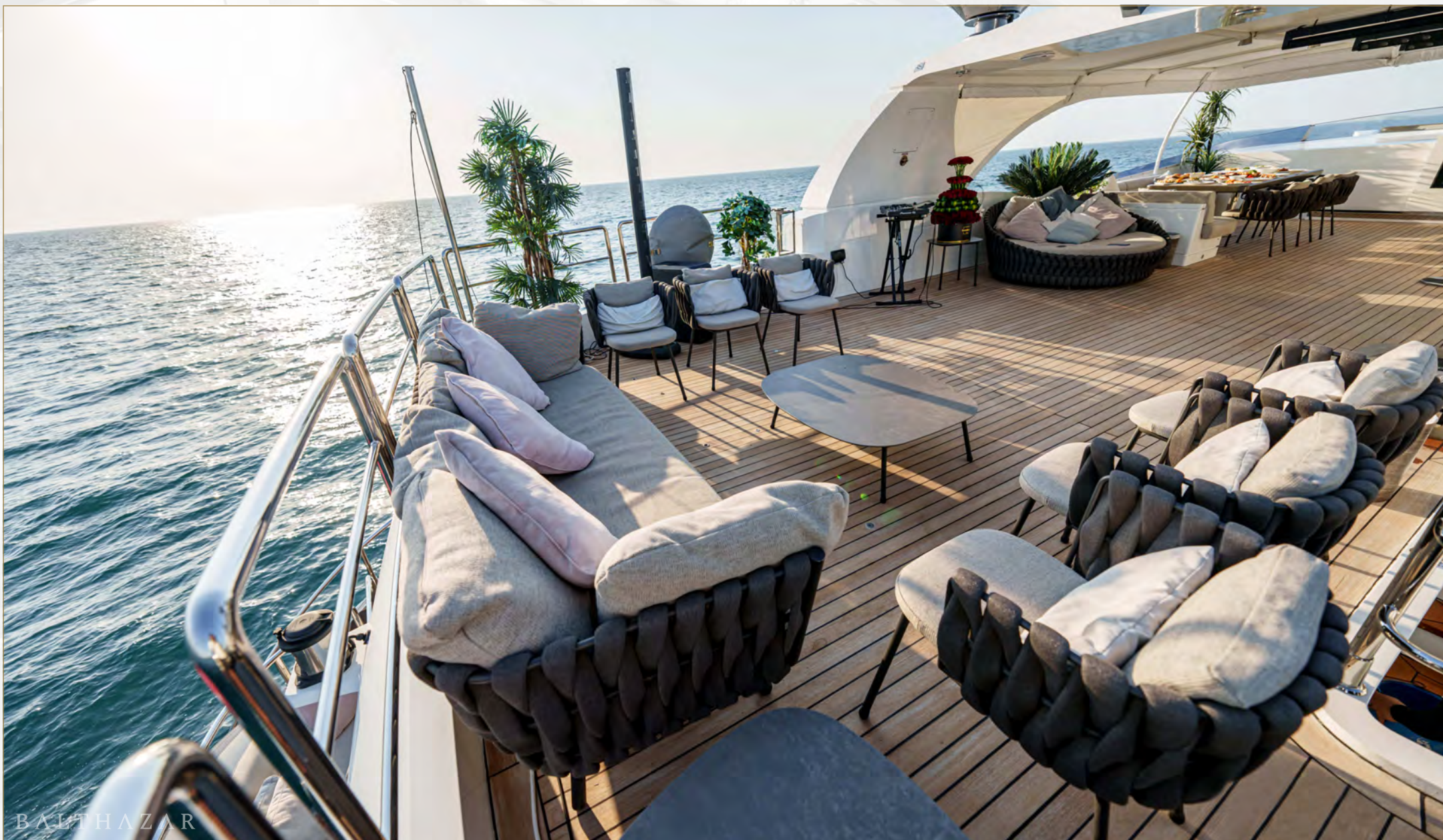
Top Deck Back