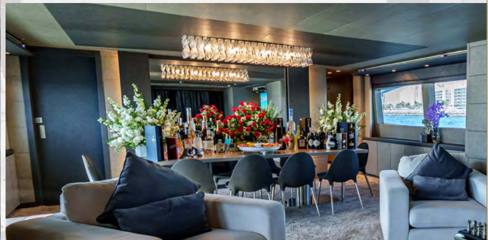
Indoor Dining Area